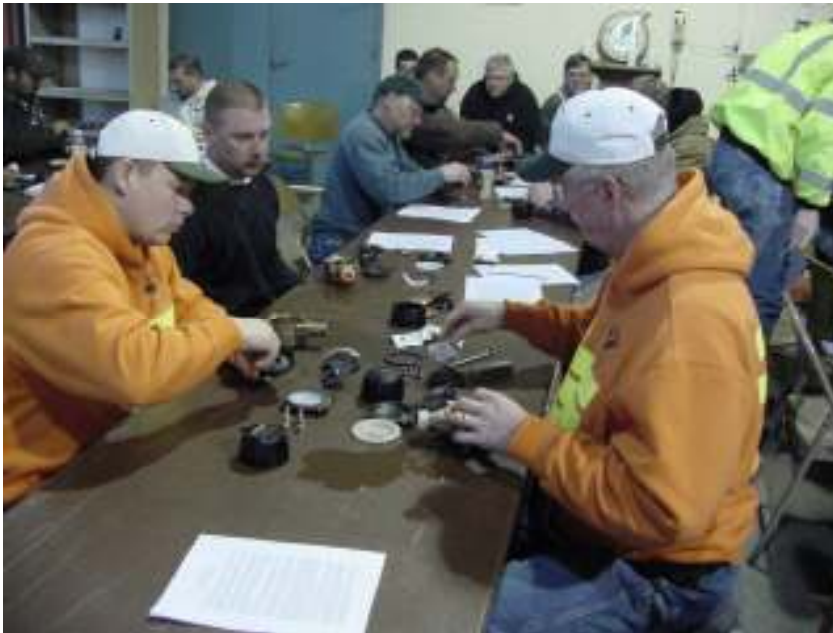
last year’s meter madness competition